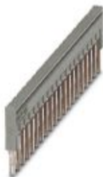
Plug-in bridge, pitch: 3.5 mm, number of positions: 20, color: gray

Please be informed that the data shown in this PDF Document is generated from our Online Catalog. Please find the complete data in the user's documentation. Our General Terms of Use for Downloads are valid ( http://phoenixcontact.com/download )