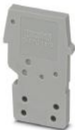
End cover, length: 17.8 mm, width: 3 mm, height: 27 mm, color: gray

Please be informed that the data shown in this PDF Document is generated from our Online Catalog. Please find the complete data in the user's documentation. Our General Terms of Use for Downloads are valid ( http://phoenixcontact.com/download )