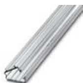
Cover profile, length: 300 mm, color: transparent