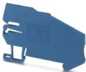
Support bracket, length: 77.7 mm, width: 2.2 mm, height: 43.4 mm, color: blue

Please be informed that the data shown in this PDF Document is generated from our Online Catalog. Please find the complete data in the user's documentation. Our General Terms of Use for Downloads are valid ( http://phoenixcontact.com/download )