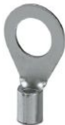
Ring cable lug, non-insulated, 10 mm², M10

Please be informed that the data shown in this PDF Document is generated from our Online Catalog. Please find the complete data in the user's documentation. Our General Terms of Use for Downloads are valid ( http://phoenixcontact.com/download )