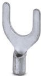
Fork-type cable lug, non-insulated, 0.5 - 1 mm 2 , M6

Please be informed that the data shown in this PDF Document is generated from our Online Catalog. Please find the complete data in the user's documentation. Our General Terms of Use for Downloads are valid ( http://phoenixcontact.com/download )