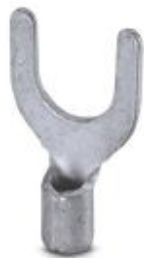
Fork-type cable lug, non-insulated, 1.1 - 2.5 mm 2 , M6

Please be informed that the data shown in this PDF Document is generated from our Online Catalog. Please find the complete data in the user's documentation. Our General Terms of Use for Downloads are valid ( http://phoenixcontact.com/download )