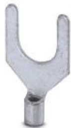
Fork-type cable lug, non-insulated, 1.1 - 2.5 mm 2 , M8

Please be informed that the data shown in this PDF Document is generated from our Online Catalog. Please find the complete data in the user's documentation. Our General Terms of Use for Downloads are valid ( http://phoenixcontact.com/download )