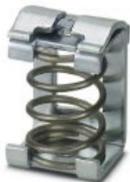
Shield connection terminal block, for applying the shield to busbars

Please be informed that the data shown in this PDF Document is generated from our Online Catalog. Please find the complete data in the user's documentation. Our General Terms of Use for Downloads are valid ( http://phoenixcontact.com/download )