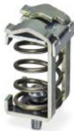
Shield connection terminal block, for applying the shield directly to the conductive mounting plates

Please be informed that the data shown in this PDF Document is generated from our Online Catalog. Please find the complete data in the user's documentation. Our General Terms of Use for Downloads are valid ( http://phoenixcontact.com/download )