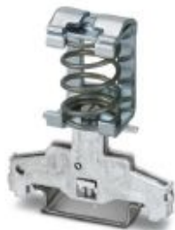
Shield connection terminal block, for applying the shield to busbars

Please be informed that the data shown in this PDF Document is generated from our Online Catalog. Please find the complete data in the user's documentation. Our General Terms of Use for Downloads are valid ( http://phoenixcontact.com/download )