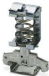
Shield connection terminal block, for applying the shield to busbars

Please be informed that the data shown in this PDF Document is generated from our Online Catalog. Please find the complete data in the user's documentation. Our General Terms of Use for Downloads are valid ( http://phoenixcontact.com/download )