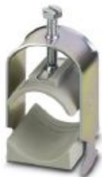
Cable clamp, for DIN rails

Please be informed that the data shown in this PDF Document is generated from our Online Catalog. Please find the complete data in the user's documentation. Our General Terms of Use for Downloads are valid ( http://phoenixcontact.com/download )