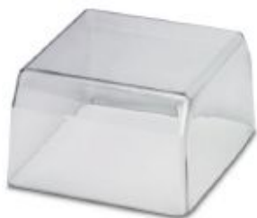
Cover, for the contact- and dust-protected encapsulation of the components

Please be informed that the data shown in this PDF Document is generated from our Online Catalog. Please find the complete data in the user's documentation. Our General Terms of Use for Downloads are valid ( http://phoenixcontact.com/download )