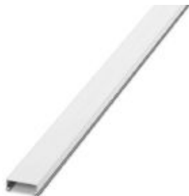
Cover for cable duct, white, width: 40 mm, length: 2000 mm

Please be informed that the data shown in this PDF Document is generated from our Online Catalog. Please find the complete data in the user's documentation. Our General Terms of Use for Downloads are valid ( http://phoenixcontact.com/download )