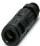
Cable gland, metric thread, IP66 protection, with strain relief

Screw connection - WP-GR HF IP66 M12 BK - 3240952