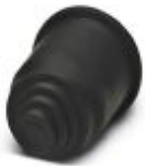
End sleeves, transition sleeves, from hose to cable

Transition sleeve from hose to cable - WP-EC TPE HF 10,0 BK - 3240974