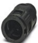
Cable gland, metric thread, IP66 protection, straight

Screw connection - WP-G HF IP66 M10 BK - 3240895