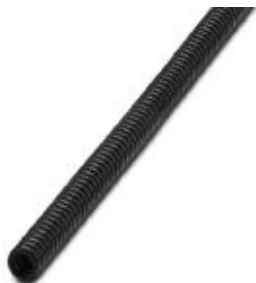
Polyamide protective hose, inflammability class V0, UV resistant

Please be informed that the data shown in this PDF Document is generated from our Online Catalog. Please find the complete data in the user's documentation. Our General Terms of Use for Downloads are valid ( http://phoenixcontact.com/download )