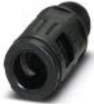
Cable gland, Pg thread, IP68/69k protection, straight

Screw connection - WP-G HF IP69K PG7 BK - 3240874