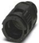
Cable gland, metric thread, IP68/69k protection, straight

Screw connection - WP-G HF IP69K M10 BK - 3240881