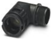
Cable gland, metric thread, IP68/69k protection, angled

Screw connection - WP-GA HF IP69K M10 BK - 3240909