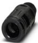
Cable gland, Pg thread, IP66 protection, straight

Screw connection - WP-G HF IP66 PG7 BK - 3240888