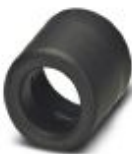
End sleeves as cable protection

Cable protection end sleeve - WP-SC PA HF 10,0 BK - 3240981