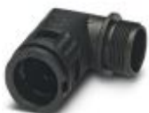
Cable gland, metric thread, IP66 protection, angled

Screw connection - WP-GA HF IP66 M10 BK - 3240923