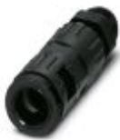
Cable gland, Pg thread, IP66 protection, with strain relief

Screw connection - WP-GR HF IP66 PG7 BK - 3240944