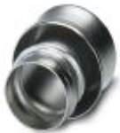
End sleeves as cable protection, made of brass

Cable protection end sleeve - WP-SC BRASS 17 - 3241067