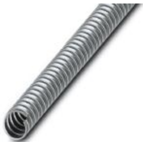
Protective hose in galvanized steel

Please be informed that the data shown in this PDF Document is generated from our Online Catalog. Please find the complete data in the user's documentation. Our General Terms of Use for Downloads are valid ( http://phoenixcontact.com/download )