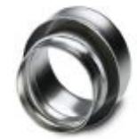
End sleeves as cable protection, made of brass

Cable protection end sleeve - WP-SC BRASS 36 - 3241070