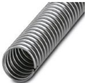
Protective hose in galvanized steel

Please be informed that the data shown in this PDF Document is generated from our Online Catalog. Please find the complete data in the user's documentation. Our General Terms of Use for Downloads are valid ( http://phoenixcontact.com/download )