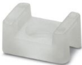
Cable binder base, for cable binders up to 5 mm wide, screwable, 3.5 mm fixing hole, 2-sided cable binder feed-through

Please be informed that the data shown in this PDF Document is generated from our Online Catalog. Please find the complete data in the user's documentation. Our General Terms of Use for Downloads are valid ( http://phoenixcontact.com/download )