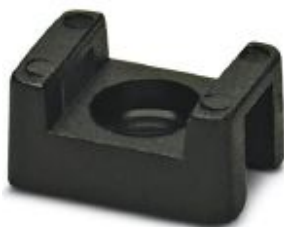
Cable binder base, for cable binders up to 5 mm wide, screwable, 3.5 mm fixing hole, 2-sided cable binder feed-through

Please be informed that the data shown in this PDF Document is generated from our Online Catalog. Please find the complete data in the user's documentation. Our General Terms of Use for Downloads are valid ( http://phoenixcontact.com/download )