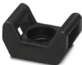
Cable binder base, for cable binders up to 9 mm wide, screwable, 5 mm fixing hole, 2-sided cable binder feed-through

Please be informed that the data shown in this PDF Document is generated from our Online Catalog. Please find the complete data in the user's documentation. Our General Terms of Use for Downloads are valid ( http://phoenixcontact.com/download )