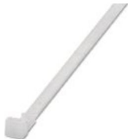
Cable binders ideal for temporary fastening, with locking release, removable

Please be informed that the data shown in this PDF Document is generated from our Online Catalog. Please find the complete data in the user's documentation. Our General Terms of Use for Downloads are valid ( http://phoenixcontact.com/download )