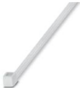
Cable binders for quick and secure bundling, standard version

Please be informed that the data shown in this PDF Document is generated from our Online Catalog. Please find the complete data in the user's documentation. Our General Terms of Use for Downloads are valid ( http://phoenixcontact.com/download )