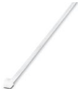
Cable binders for quick and secure bundling, standard version

Please be informed that the data shown in this PDF Document is generated from our Online Catalog. Please find the complete data in the user's documentation. Our General Terms of Use for Downloads are valid ( http://phoenixcontact.com/download )