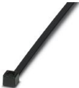
Cable binders for quick and secure bundling, standard version

Please be informed that the data shown in this PDF Document is generated from our Online Catalog. Please find the complete data in the user's documentation. Our General Terms of Use for Downloads are valid ( http://phoenixcontact.com/download )