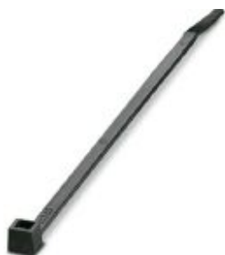
Cable binders for quick and secure bundling, standard version

Please be informed that the data shown in this PDF Document is generated from our Online Catalog. Please find the complete data in the user's documentation. Our General Terms of Use for Downloads are valid ( http://phoenixcontact.com/download )