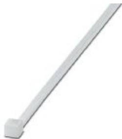
Cable binders for quick and secure bundling, standard version

Please be informed that the data shown in this PDF Document is generated from our Online Catalog. Please find the complete data in the user's documentation. Our General Terms of Use for Downloads are valid ( http://phoenixcontact.com/download )