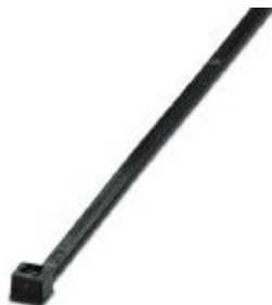
Cable binders for quick and secure bundling, standard version

Please be informed that the data shown in this PDF Document is generated from our Online Catalog. Please find the complete data in the user's documentation. Our General Terms of Use for Downloads are valid ( http://phoenixcontact.com/download )