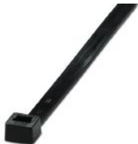
Cable binders for quick and secure bundling, standard version

Please be informed that the data shown in this PDF Document is generated from our Online Catalog. Please find the complete data in the user's documentation. Our General Terms of Use for Downloads are valid ( http://phoenixcontact.com/download )