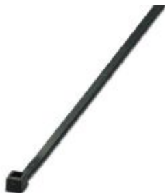
Cable binders for quick and secure bundling, heat stabilized to 125°C (also up to 145°C for brief periods)

Please be informed that the data shown in this PDF Document is generated from our Online Catalog. Please find the complete data in the user's documentation. Our General Terms of Use for Downloads are valid ( http://phoenixcontact.com/download )