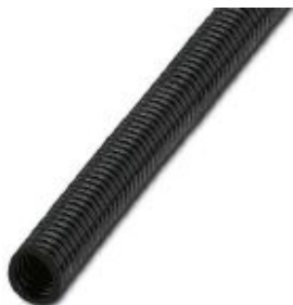
Polyamide protective hose, inflammability class HB, UV resistant

Please be informed that the data shown in this PDF Document is generated from our Online Catalog. Please find the complete data in the user's documentation. Our General Terms of Use for Downloads are valid ( http://phoenixcontact.com/download )