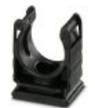
Hose holder with cover

Hose holder with cover - WP-BASE C PA HF 21,2 BK - 3240961