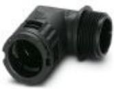
Cable gland, metric thread, IP66 protection, angled

Screw connection - WP-GA HF IP66 M25 BK - 3240927