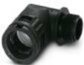
Cable gland, metric thread, IP68/69k protection, angled

Screw connection - WP-GA HF IP69K M20 BK - 3240912