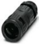
Cable gland, Pg thread, IP66 protection, with strain relief

Screw connection - WP-GR HF IP66 PG16 BK - 3240947