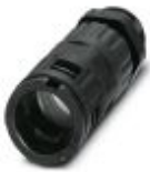
Cable gland, Pg thread, IP68/69k protection, with strain relief

Screw connection - WP-GR HF IP69K PG16 BK - 3240933