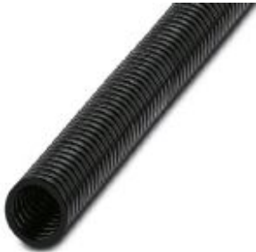
Polyamide protective hose, inflammability class HB, UV resistant

Please be informed that the data shown in this PDF Document is generated from our Online Catalog. Please find the complete data in the user's documentation. Our General Terms of Use for Downloads are valid ( http://phoenixcontact.com/download )