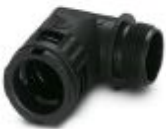
Cable gland, Pg thread, IP66 protection, angled

Screw connection - WP-GA HF IP66 PG16 BK - 3240919