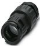
Cable gland, metric thread, IP68/69k protection, with strain relief

Screw connection - WP-GR HF IP69K M25 BK - 3240941