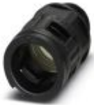
Cable gland, metric thread, IP68/69k protection, straight

Screw connection - WP-G HF IP69K M20 BK - 3240884