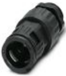
Cable gland, metric thread, IP66 protection, with strain relief

Screw connection - WP-GR HF IP66 M25 BK - 3240955