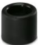
End sleeves as cable protection

Cable protection end sleeve - WP-SC PA HF 28,5 BK - 3240985