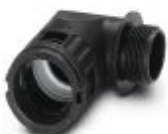
Cable gland, metric thread, IP68/69k protection, angled

Screw connection - WP-GA HF IP69K M25 BK - 3240913