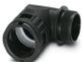
Cable gland, Pg thread, IP68/69k protection, angled

Screw connection - WP-GA HF IP69K PG21 BK - 3240906