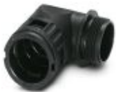
Cable gland, Pg thread, IP66 protection, angled

Screw connection - WP-GA HF IP66 PG21 BK - 3240920