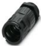
Cable gland, metric thread, IP66 protection, with strain relief

Screw connection - WP-GR HF IP66 M32 BK - 3240956