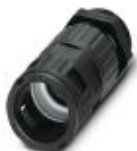
Cable gland, metric thread, IP68/69k protection, with strain relief

Screw connection - WP-GR HF IP69K M32 BK - 3240942