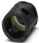
Cable gland, metric thread, IP68/69k protection, straight

Screw connection - WP-G HF IP69K M25 BK - 3240885