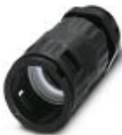
Cable gland, Pg thread, IP68/69k protection, with strain relief

Screw connection - WP-GR HF IP69K PG21 BK - 3240934