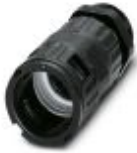
Cable gland, Pg thread, IP66 protection, with strain relief

Screw connection - WP-GR HF IP66 PG21 BK - 3240948