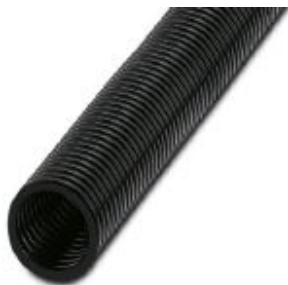
Polyamide protective hose, inflammability class HB, UV resistant

Please be informed that the data shown in this PDF Document is generated from our Online Catalog. Please find the complete data in the user's documentation. Our General Terms of Use for Downloads are valid ( http://phoenixcontact.com/download )