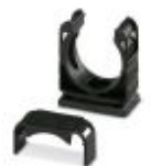
Hose holder with cover

Hose holder with cover - WP-BASE C PA HF 28,2 BK - 3240962