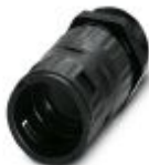
Cable gland, Pg thread, IP66 protection, with strain relief

Screw connection - WP-GR HF IP66 PG36 BK - 3240950