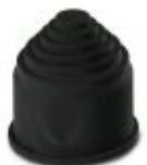
End sleeves, transition sleeves, from hose to cable

Transition sleeve from hose to cable - WP-EC TPE HF 42,5 BK - 3240980