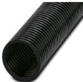
Polyamide protective hose, inflammability class HB, UV resistant

Please be informed that the data shown in this PDF Document is generated from our Online Catalog. Please find the complete data in the user's documentation. Our General Terms of Use for Downloads are valid ( http://phoenixcontact.com/download )