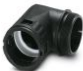
Cable gland, Pg thread, IP68/69k protection, angled

Screw connection - WP-GA HF IP69K PG36 BK - 3240908