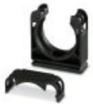
Hose holder with cover

Hose holder with cover - WP-BASE C PA HF 42,5 BK - 3240964