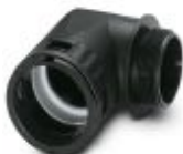
Cable gland, metric thread, IP68/69k protection, angled

Screw connection - WP-GA HF IP69K M40 BK - 3240915