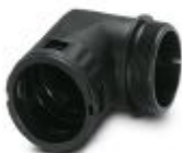
Cable gland, Pg thread, IP66 protection, angled

Screw connection - WP-GA HF IP66 PG36 BK - 3240922