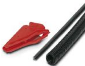
Polyamide protective hose, inflammability class V0, UV resistant

Please be informed that the data shown in this PDF Document is generated from our Online Catalog. Please find the complete data in the user's documentation. Our General Terms of Use for Downloads are valid ( http://phoenixcontact.com/download )