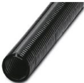
Polyamide protective hose, inflammability class V0, UV resistant

Please be informed that the data shown in this PDF Document is generated from our Online Catalog. Please find the complete data in the user's documentation. Our General Terms of Use for Downloads are valid ( http://phoenixcontact.com/download )