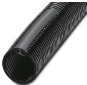
Polyamide protective hose, inflammability class V0, UV resistant

Please be informed that the data shown in this PDF Document is generated from our Online Catalog. Please find the complete data in the user's documentation. Our General Terms of Use for Downloads are valid ( http://phoenixcontact.com/download )