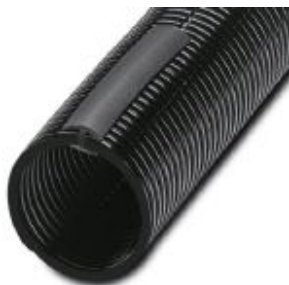
Polyamide protective hose, inflammability class V0, UV resistant

Please be informed that the data shown in this PDF Document is generated from our Online Catalog. Please find the complete data in the user's documentation. Our General Terms of Use for Downloads are valid ( http://phoenixcontact.com/download )