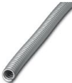
Protective hose, spring steel wire with PVC coating, highly stranded

Please be informed that the data shown in this PDF Document is generated from our Online Catalog. Please find the complete data in the user's documentation. Our General Terms of Use for Downloads are valid ( http://phoenixcontact.com/download )