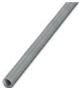
Protective hose, spring steel wire with PVC coating, highly stranded

Please be informed that the data shown in this PDF Document is generated from our Online Catalog. Please find the complete data in the user's documentation. Our General Terms of Use for Downloads are valid ( http://phoenixcontact.com/download )