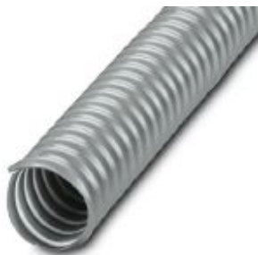
Protective hose, spring steel wire with PVC coating, highly stranded

Please be informed that the data shown in this PDF Document is generated from our Online Catalog. Please find the complete data in the user's documentation. Our General Terms of Use for Downloads are valid ( http://phoenixcontact.com/download )