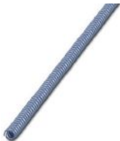
Protective hose, spring steel wire with PU coating, highly stranded

Please be informed that the data shown in this PDF Document is generated from our Online Catalog. Please find the complete data in the user's documentation. Our General Terms of Use for Downloads are valid ( http://phoenixcontact.com/download )