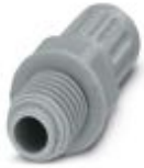
Cable gland made from PP with metric thread, rotatable, IP54 protection

Screw connection - WP-GT PP HF M12 - 3241010