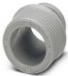
End sleeves as cable protection

Cable protection end sleeve - WP-SC HF 10 - 3241016