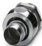
Cable gland made from brass with Pg thread, IP40 protection

Screw connection - WP-G BRASS IP40 PG11 - 3241039