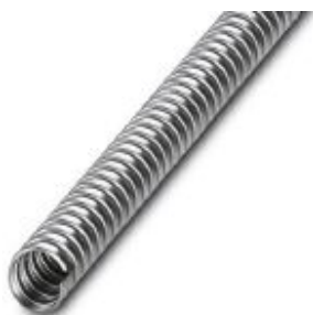
Protective hose in stainless steel

Please be informed that the data shown in this PDF Document is generated from our Online Catalog. Please find the complete data in the user's documentation. Our General Terms of Use for Downloads are valid ( http://phoenixcontact.com/download )