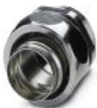
Cable gland made from brass with Pg thread, IP40 protection

Screw connection - WP-G BRASS IP40 PG21 - 3241041