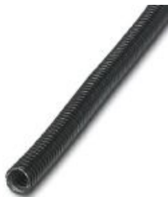
Galvanized steel protective hose with PVC coating

Please be informed that the data shown in this PDF Document is generated from our Online Catalog. Please find the complete data in the user's documentation. Our General Terms of Use for Downloads are valid ( http://phoenixcontact.com/download )