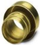
End sleeves as cable protection, made of brass, for WP-STEEL PVC C

Cable protection end sleeve - WP-SC BRASS WP PVC 21 - 3241075