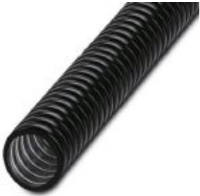
Galvanized steel protective hose with PVC coating

Please be informed that the data shown in this PDF Document is generated from our Online Catalog. Please find the complete data in the user's documentation. Our General Terms of Use for Downloads are valid ( http://phoenixcontact.com/download )