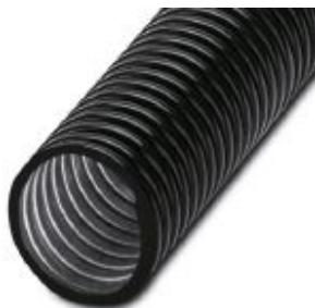
Galvanized steel protective hose with PVC coating

Please be informed that the data shown in this PDF Document is generated from our Online Catalog. Please find the complete data in the user's documentation. Our General Terms of Use for Downloads are valid ( http://phoenixcontact.com/download )