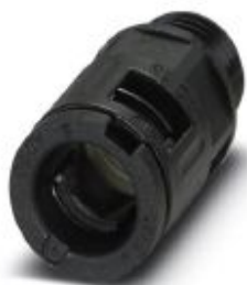
Cable gland, Pg thread, IP68/69k protection, straight

Please be informed that the data shown in this PDF Document is generated from our Online Catalog. Please find the complete data in the user's documentation. Our General Terms of Use for Downloads are valid ( http://phoenixcontact.com/download )