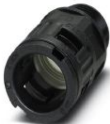
Cable gland, Pg thread, IP68/69k protection, straight

Please be informed that the data shown in this PDF Document is generated from our Online Catalog. Please find the complete data in the user's documentation. Our General Terms of Use for Downloads are valid ( http://phoenixcontact.com/download )